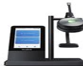
WH66 with charger * Wireless charger is optional