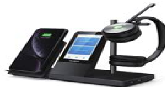
WH66 Mono/Dual: Teams WH66 Mono/Dual: UC

Busylight is enabled in WH66. With the light on the headset or BLT60 on the desk turning red, people around you would know that you are on the phone, instead of interrupting you unknowingly. Just stay focused on conversation, for higher efficiency, for better collaboration.