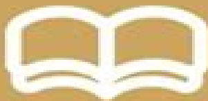
Reading Comprehension test