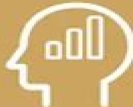
Critical Thinking test