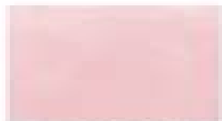
BOIS DE ROSE