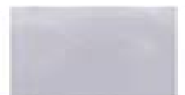
GRIS DE LIN