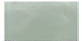
VERT DE GRIS