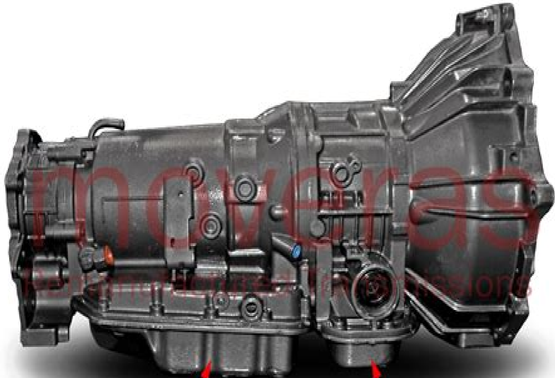
16-Bolt Rear Pan