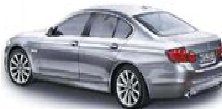
Fig. 1: Identifying BMW 5 Series Saloon

The F10 5 Series was introduced in to the US market in March of 2009. The vehicle is available in 528i, 535i and 550i models.