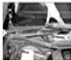
12.14 ... and fit of the complete weatherstripping