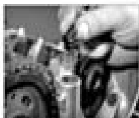
8.10b ... timing ...