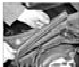
12.13 ... fuel coast bolt the weatherstripping