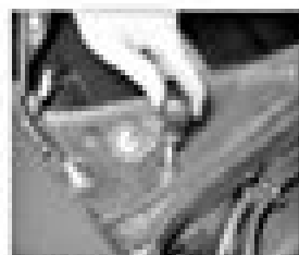
12.12 Refit the profile securing screws