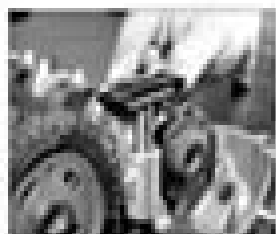
8.10a Removing the secondary chain tensioner plunger