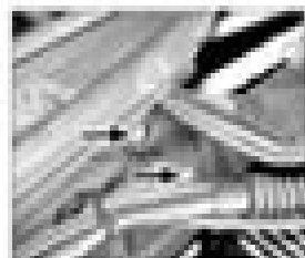
12.16 Right hand air ducting securing screws removed

10 Disconnect the intake sensor vacuum from the weatherstripping (see illustration).