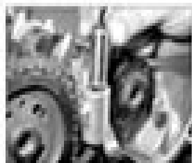
8.10c ... and plunger housing