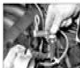
12.18 Reconnecting the intake sensor vacuum hose