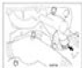
8.1 VVTDS adjustment unit and fuel coast pipe bolt removed

11 The exhaust intake control(s) operate may be fixed. The fuel type has not yet