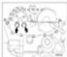
8.10 Uncover the fuel coast pipe secured to expose the camshaft adjustment securing bolt(s)