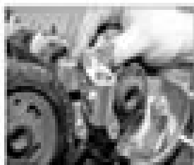
8.10d Refitting the secondary timing chain tensioner housing

1 Uncover the cover bolt and disconnect the air feed pipe from the front of the variable adjustment unit (see illustration). Remove the timing pipe.