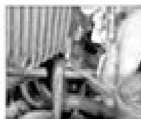
12.19 Uncover the hole securing the manifold to the support bracket