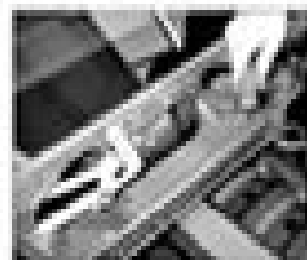
12.15 ... fuel coast bolt the weatherstripping