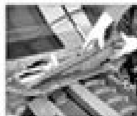
12.17 Removing the air ducting