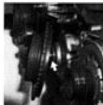
Fig. 117-9: Timing chain assembly with timing chain sprocket. See Fig. 117-9.