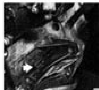
Fig. 117-11: Timing chain assembly with timing chain sprocket. See Fig. 117-11.