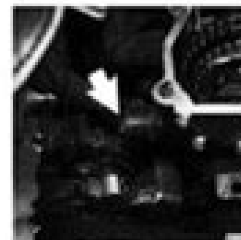
Fig. 117-12: Timing chain assembly with timing chain sprocket.