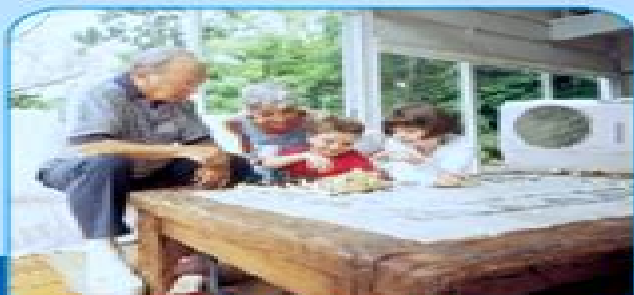
Rotated cool air lets you stay cool and relaxed.

Using the same principles as nature to cool, the Cenvair Prestige 900 allows you to enjoy naturally cooled air and gentle breezes wherever you want them. The patented evaporative air conditioning system helps you stay cool at all times and is a low-cost alternative to full air conditioning which is both costly to install and to run.