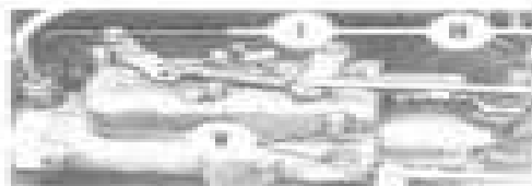
Fig. 10.—Haber and Spence's (1900) data: mean inspection times (seconds) for the three categories. (Source: data obtained from the original text. Data source: (1) the published data were taken directly from the original text; (2) the authors' own data.)

Das Interviewformat erlaubt es, die Aussagen der Teilnehmer zu verifizieren und zu validieren, indem sie sich gegenseitig bestätigen.