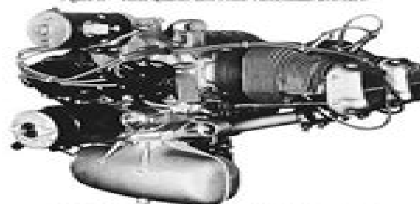
Figure 4. Three-Quarter Right Hand View, Model C700 1997