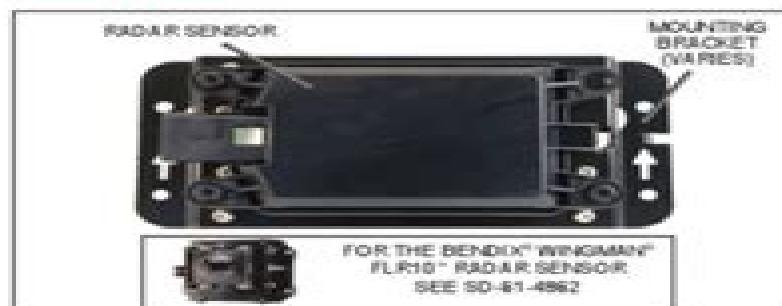
FIGURE 1 - BENDIX® WINGMAN® FLR20™ RADAR SENSOR AND COVER

The driver is always responsible for the control and safe operation of the vehicle at all times. The Bendix Wingman Advanced system does not replace the need for a skilled, alert professional driver, reacting appropriately and in a timely manner, and using safe driving practices.