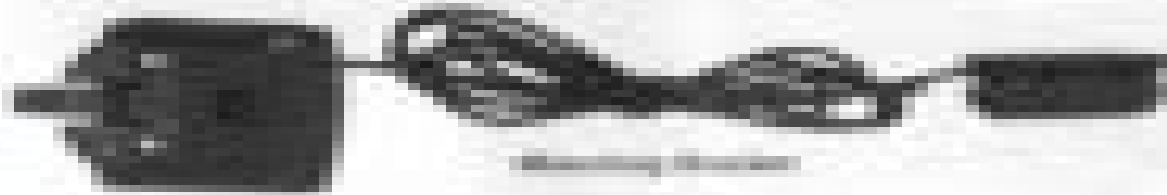
20 BIKE COMPUTER