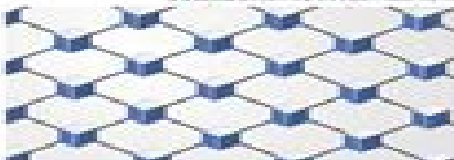
ENTERPRISE SERVER MANAGEMENT