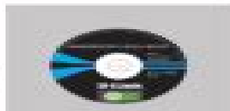
CD-ROM (D-Link Click'n Connect Manual and Warranty)