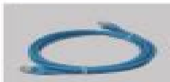
Ethernet (CAT5 UTP) Cable