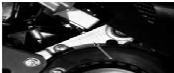
ENGINE SERIAL NUMBER LOCATION