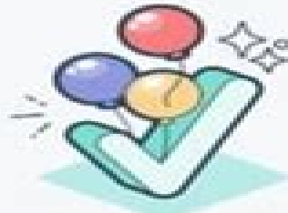
Customer Exp Simulation