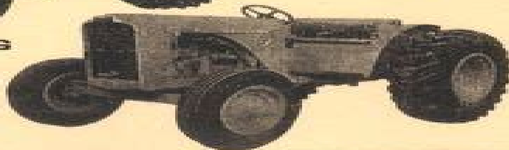
CHAMPION INDUSTRIAL MK.II