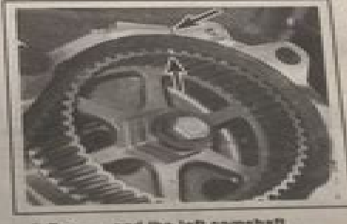
6.7c . . . and the left camshaft sprocket timing mark aligns with the mark on the rear cover