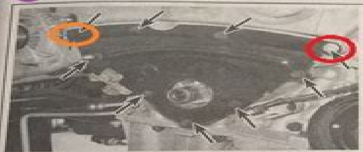
6.6a Location of the lower timing belt cover mounting fasteners