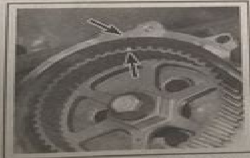
6.7b . . . the right camshaft sprocket timing mark aligns with the mark on the rear cover . . .