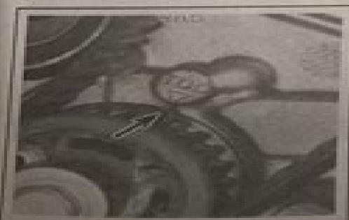
6.7a Rotate the crankshaft until the pointer on the crankshaft sprocket aligns with the TDC mark on the oil pump cover . . .