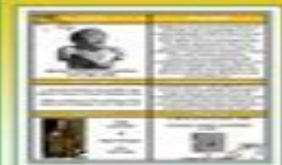
Aesop Author's Card

> Archetypes > Anthropomorphism Mini-Lesson