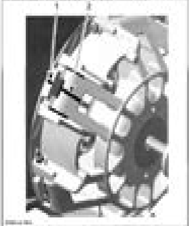
1. Mark on drive pulley locking nut 2. Mark on governor cup

CAUTION: Prior to removing the drive pulley, mark sliding belt and governor cup together to ensure correct reinstallation. There are only 4 grooves mounted out of 8 possible positions.