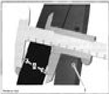
1. Drive pulley 2. Pry bar