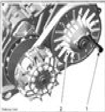
1. Drive pulley cover 2. Pry bar or screwdriver

To remove belt no. 4, slip the belt over the top edge of sliding belt, as shown.