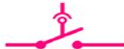
Differential Switch Symbol