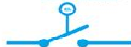
Timer Switch Symbol