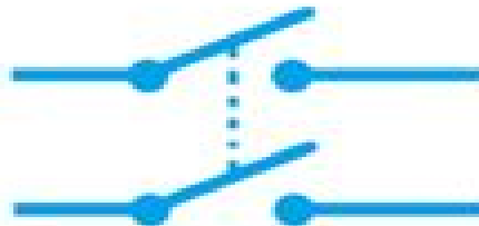
DPST Switch Symbol (Double Pole Single Throw)