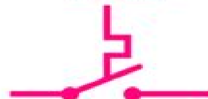
Thermal Switch Symbol