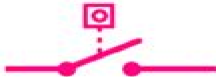
Counter Switch Symbol