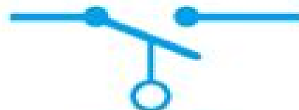
Float Switch Symbol