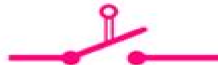
Limit Switch Symbol