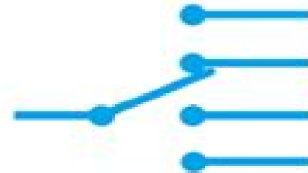
SPMT Switch Symbol (Single Pole Multiple Throw)