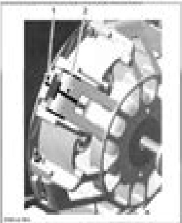
1. Mark on drive pulley locking bolt 2. Mark on governor cup

CAUTION: Prior to removing the drive pulley, mark sliding rail and governor cup together to ensure correct reinstallation. There are only 4 grooves mounted out of 8 possible positions.