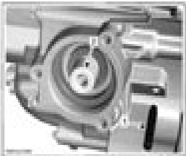
1. Crankshaft locking bolt 2. Lock rail with cover