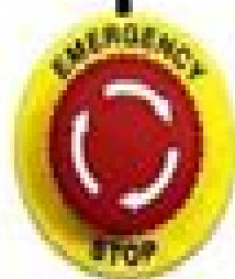
E - Stop Button