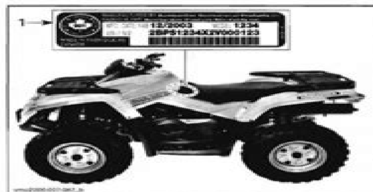
TYPICAL 1. V.I.N. (Vehicle Identification Number)