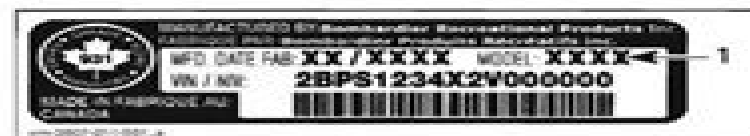
TYPICAL — VEHICLE IDENTIFICATION NUMBER LABEL 1. Model number