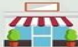
YOUR OWN BUSINESS