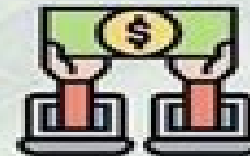
PEER TO PEER LENDING