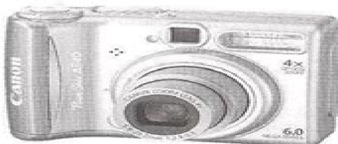
Photo of PowerShot A540