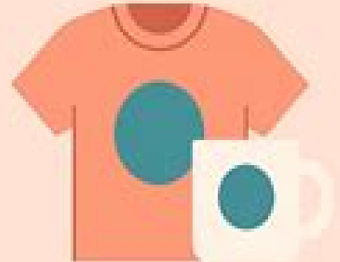
PRINT ON DEMAND