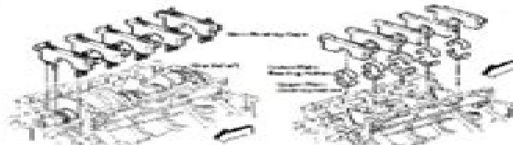
Some of the main engine components

The block, highlighted at right in grey, is a heavy metal casting, usually cast iron or aluminum, which holds the lower parts of the engine together and in place. The block assembly consists of the block , crankshaft , main bearings and caps , connecting rods , pistons , and other components, and is referred to as the bottom end . The block may also house the camshaft , oil pump , and other parts. The block is machined with passages for oil circulation called oil galleries (not shown) and for coolant circulation called water jackets .