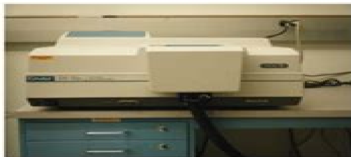
Cary 100 Bio UV-Vis Spectrophotometer

The Cary 100 Bio UV-Vis instrument is a powerful double-beam spectrophotometer capable of quickly acquiring data in the spectral range from 200 to 900 nanometers. The configuration includes a thermostatic multicell sample transport and a Harrick diffuse reflectance unit. The instrument was originally purchased in 2008 and was moved to CIF in July, 2012.