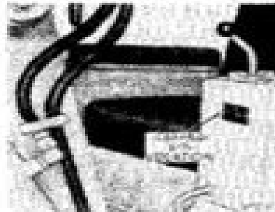
Figure 3 - Crawler Serial Number Location