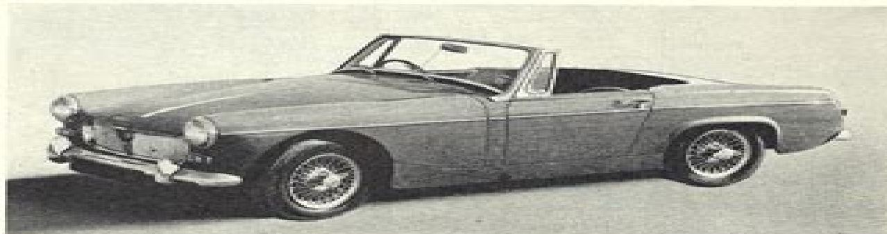
DISTINGUISHING FEATURES: Swivelling quarter lights and wind-up windows identify the Mark II cars in latest form, although styling in general follows the lines of previous models

P RODUCED under the overall aegis of the British Motor Corporation, the M.G. Midget is now in Mk. II form. It differs from the preceding model in a number of ways, and readers will recall that late Mk. I versions of these cars were fitted with the 1200-cc. engine and disc brakes on front wheels. These components are, of course, standard fittings on current Mk. II cars.